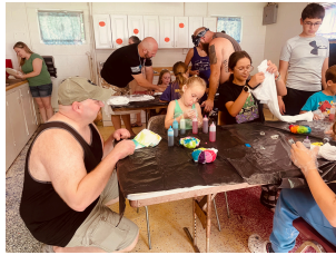
TYE DYING IS A FAVORITE ACTIVITY FOR ADULTS AND CHILDREN AT PNH.