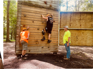
EVEN A PROSTHESIS DOESN'T KEEP THIS VETERAN FROM THE ZIPLINE AND CLIMBING WALL