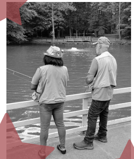
THIS COUPLE ENJOYS FISHING FOR THE TROUT IN BEACON LODGE POND