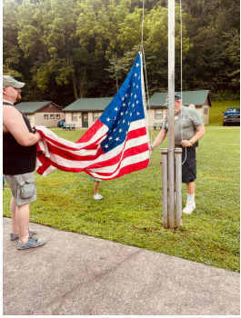
FLAG IS RAISED EACH MORNING, AND RETIRED EACH EVENING