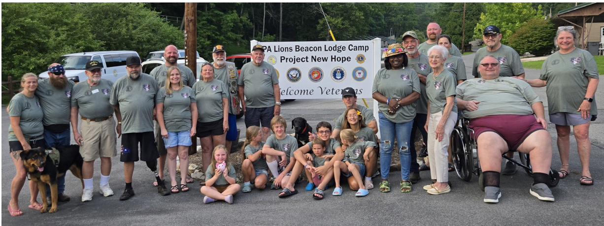
VETERANS, FAMILIES AND TWO SERVICE DOGS ENJOYED THE RELAXATION AND CAMARADERIE OF FELLOW VETERANS.