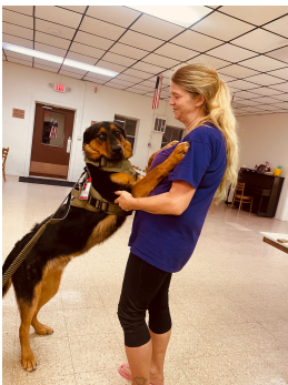
ONLY CERTIFIED SERVICE DOGS ARE PERMITTED AT BEACON LODGE CAMP