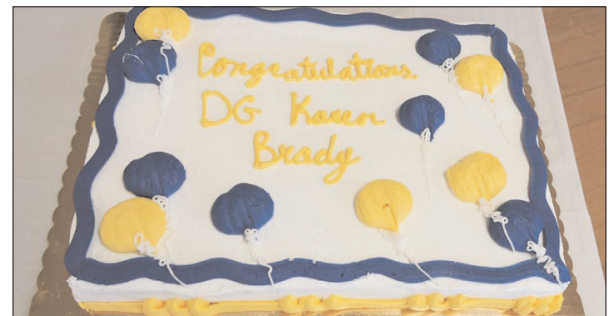
Two specially decorated Lions cakes, one congratulating DG Brady, were sliced up for dessert