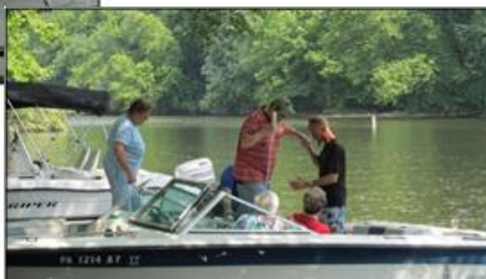
Clients of the Center for Vision Loss prepare to board their boats for a thrilling ride on the Lehigh River.

The fear on their faces is soon replaced with gigantic smiles as they cast off and venture on their way. The clients tell us that they look forward to the picnic every year. It is a tremendous social event and with limited access to transportation, it affords them the opportunity to spend a day with their friends.