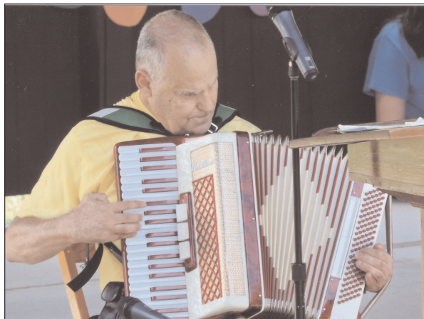
A blind camper who has camped at Beacon Lodge for 50 of his 69 years plays an accordion as part of the entertainment on Lions Appreciation Day, July 16.