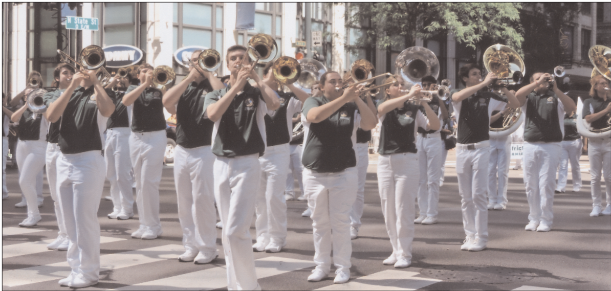
All State Band composed of players from all over Pa. offered rousing songs.