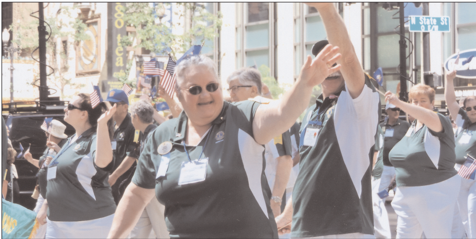
Pennsylvania Lions and Lionesses wave to the crowds for the Chicago parade on Lions International's 100th anniversary.