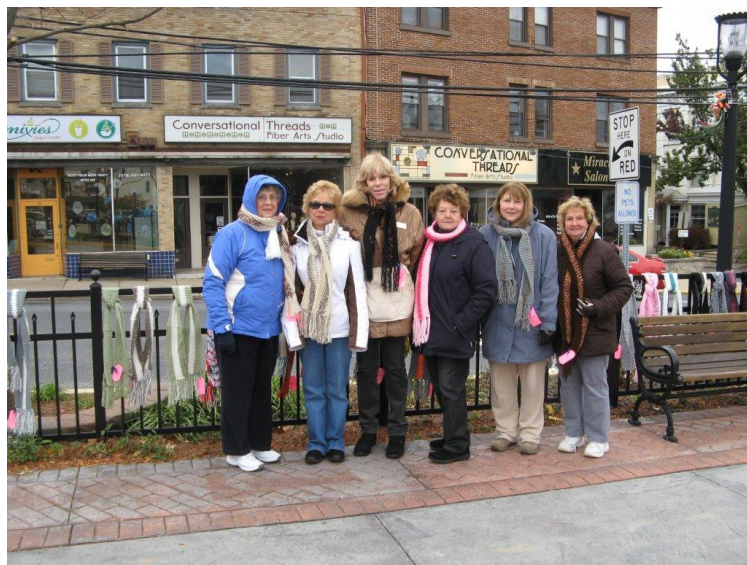
Emmaus Lioness-Lions "Chase the Chill"

Over 300 scarves were knitted or crochet by our Club members and they were "free" to anyone who wanted one. It is our way of "giving back" to the community and showing our appreciation for all the support they give us.