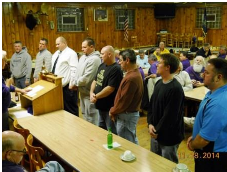
standing from left to right: