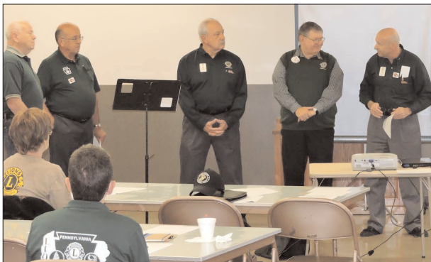
All seven of these Lions had something to contribute making the seminar useful.