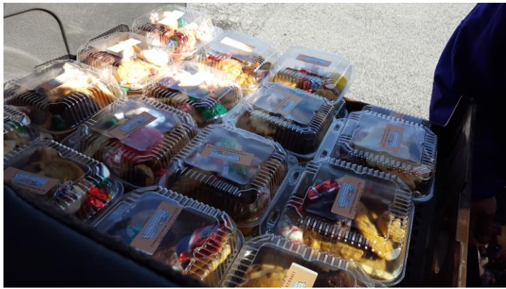
Members of the Upper Lehigh Lions Club made 75 boxes of cookies for the clients of Lehigh County Meals on Wheels for Thanksgiving.