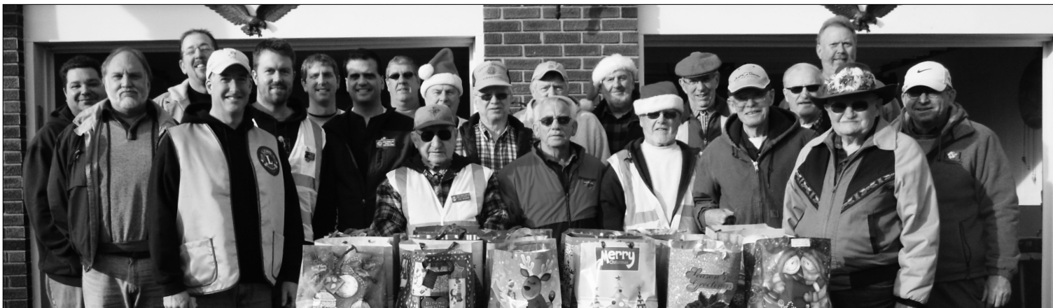
MEMBERS of the Lehigh Township Lions Club went all out delivering 225 Christmas fruit baskets to Lehigh Township residents who are elderly, shut-in, widows/widowers, or elderly living alone. An annual tradition with the club since 1974, the Lehigh Township Lions purchase and prepare the fruit for delivery to the many appreciative recipients - that's 40 consecutive years! A Lions Roar to all of them.