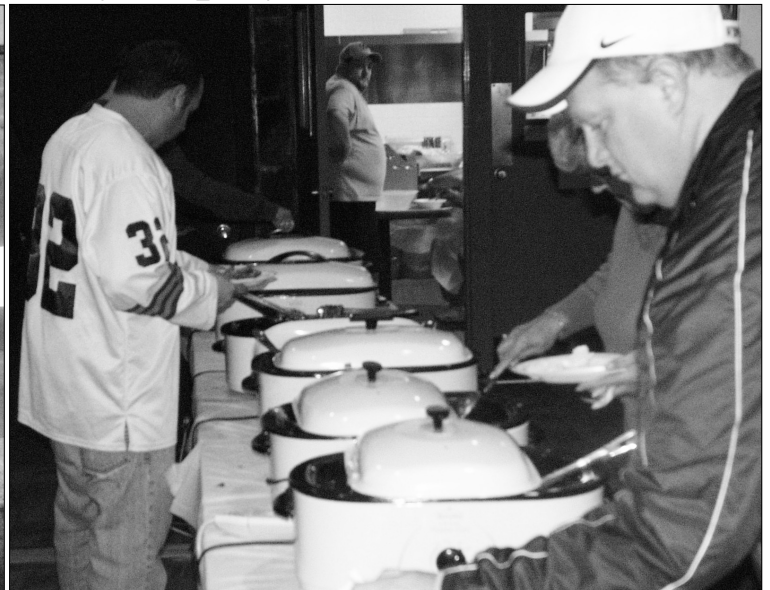
COPLAY LIONS CLUB has a public breakfast on every Super Bowl Sunday. In photo at left two of them made sausage and at right people help themselves to the ingredients. The Coplay Saengerbund was packed with patrons on February 2nd, enjoying the breakfast of scrambled eggs, ham, sausage, hash, pancakes, and toast, along with orange juice and coffee. The ladies also had a bake sale.