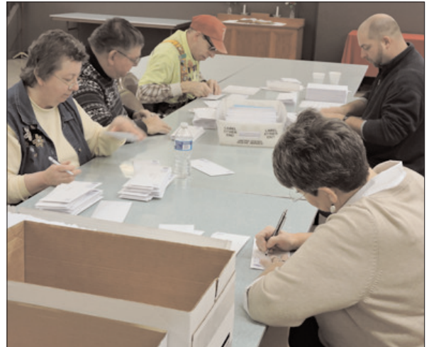
Putting the finishing touches on the mailing of letters about the upcoming convention and Melvin Jones Fellows luncheon.

club that collected them and the amount inside the boxes.