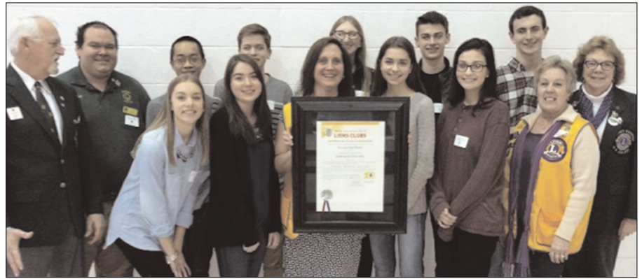
Emmaus Leo Club stands with new club charter.