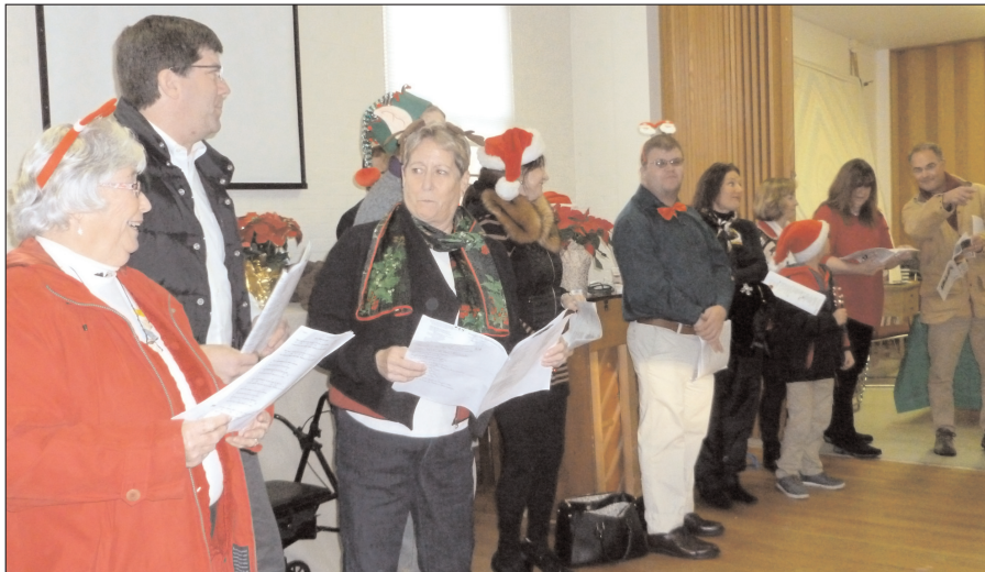
Christ Lutheran Carolers get ready to sing at Christmas party for senior citizens and needy in Hellertown.