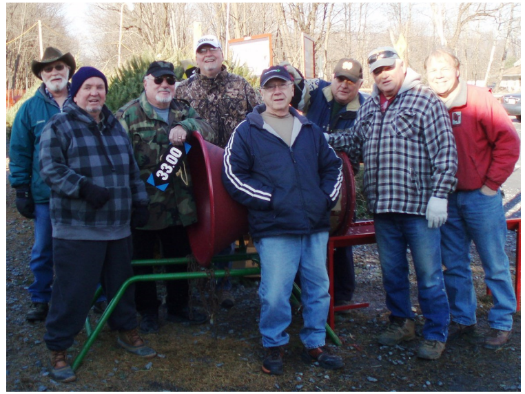
Slatington Lions Members trimming the trees for sale.

We are very happy to report that this year's trees, although were somehow heavier and taller this year we SOLD OUT of every tree. Here is a picture of some of the group of Lions that were there to help trim the ones that needed some attention to make the sales successful. Sales ended on December 20 th , 2013