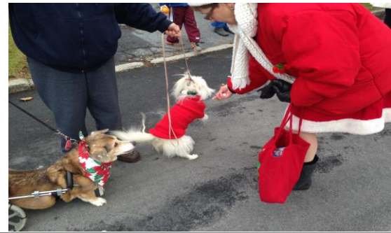
Even the good Puppies received a treat from Santa and Mrs. Claus