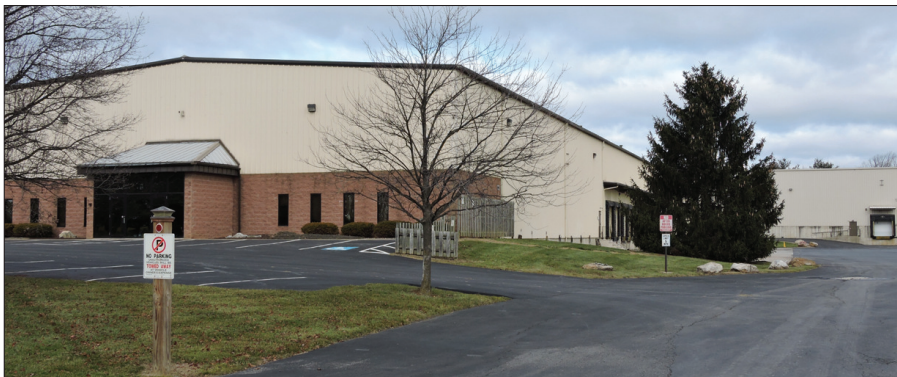
The former Pet Food & Supplies warehouse in East Allen Township will become the new Second Harvest Food Bank warehouse in the very near future. It will double their food capacity to serve affiliated food banks or pantries.

What a great way for these families to purchase food for the holiday season. The project also makes the people aware of the club and what they do for the community.