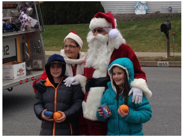
Santa and Mrs. Claus hand out candy and oranges