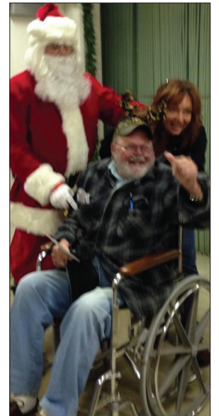
Kuhnsville Lions Club Christmas party for the blind and deaf held on December 13.

Family owned and operated for over 100 years.