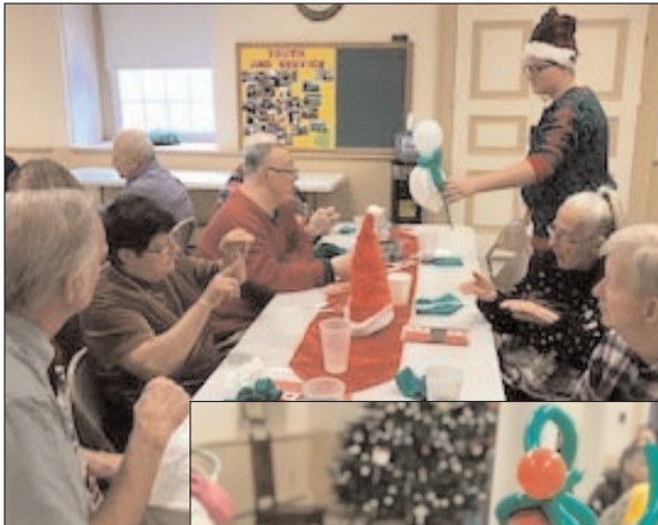
Lehigh Valley Saturday A.M. Lions joined in the fun visiting Kuhnsville Lions Christmas party at St. John's UCC on Saturday, Dec. 8. A good time was had by all!