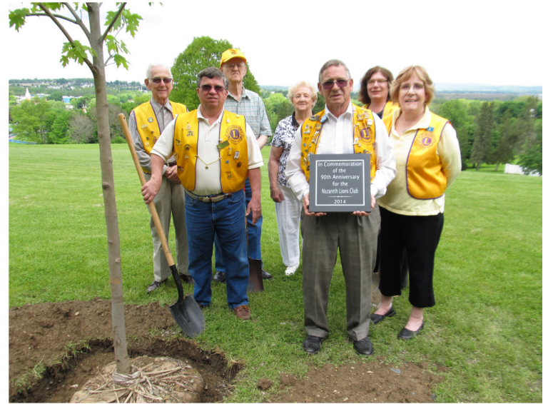
Left: club members w/ charter. Above/below: tree planting & plaque.