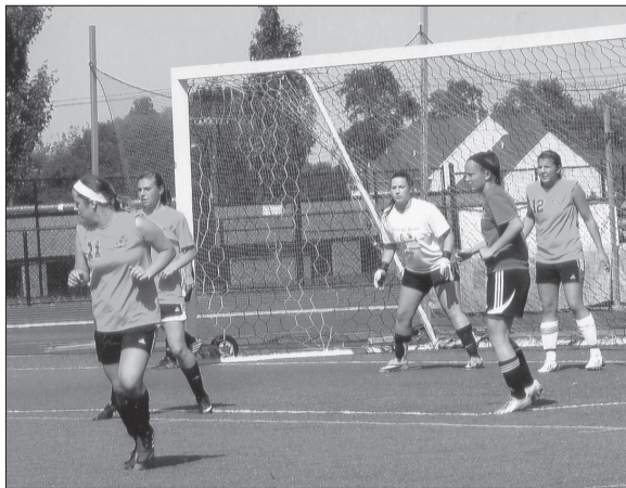
Players from the Colonial and LVC/MVC girls teams are shown in front of one of the nets at the All-Star Soccer Classic.