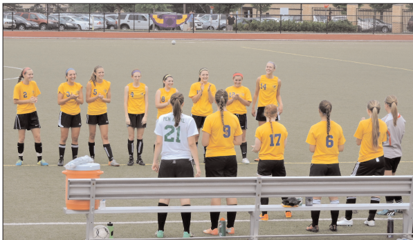
Colonial League Girls won the game 4-2.