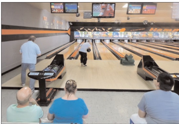
Bowling at Hampton Lanes in Northampton.