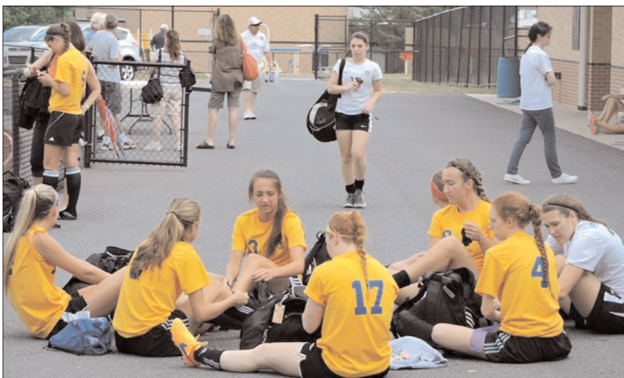
Colonial girls got together after they put on their gold t-shirts.