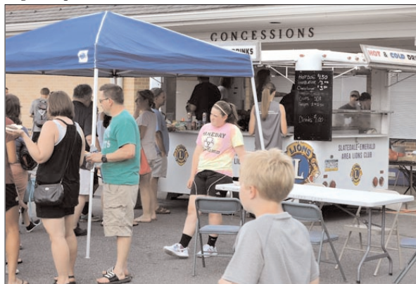
Slatedale-Emerald Area Lions had the refreshment stand for the games.