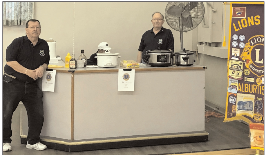
Great crowd attended the Alburtis Lions barbecue sale this past month.