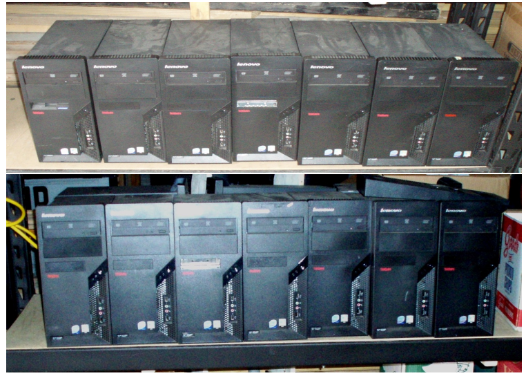
The last of our inventory of computers.