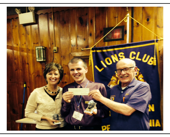
Presenting the donation to the Special Olympics

http://www.specialolympicscarboncounty.com/