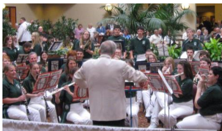
Hear our All State Band in concerts Saturday at 11 a.m. and 4:45 p.m. Show your pride in our band and support one of our youth projects by attending one or both band concerts.