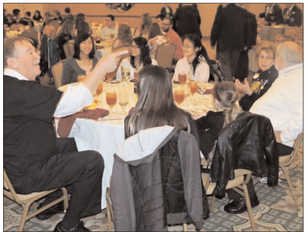
Above: Leos and their counselors enjoyed luncheon.

After that project, most of the Leos remained to enjoy the noon luncheon.