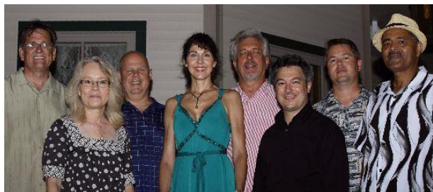
The Fabulous Cheeze Brothers and Sisters will entertain during Friday evening's Hospitality Night.