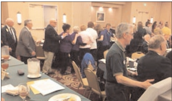
Doing the "Bunny Hop" at the convention luncheon.