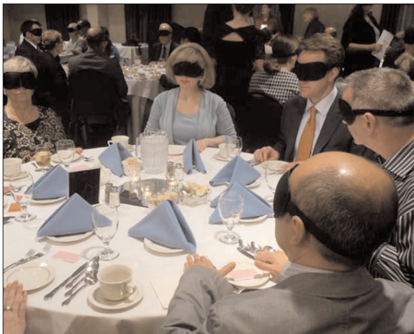
Fox Optical receives instructions.

The Center for Vision Loss is the region's only community benefit organization dedicated to improving the lives of people with vision loss and promoting healthy vision in the community. The agency serves Lehigh, Northampton and Monroe Counties with offices in Allentown and Stroudsburg. For more information go to www.centerforvisionloss.org or call 610-433-6018.