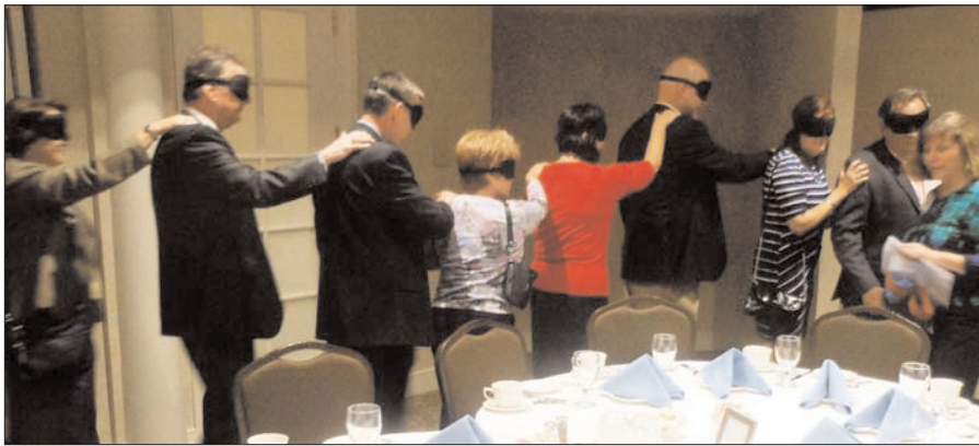
Air Products guests enter the room for "A Taste of the Shadows".