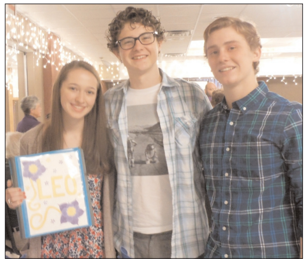
Three Leos from Northwestern High School attended the "needs breakfast". It was the first time Leos had attended and enjoyed the breakfast at the Northampton Banquet & Events Center.