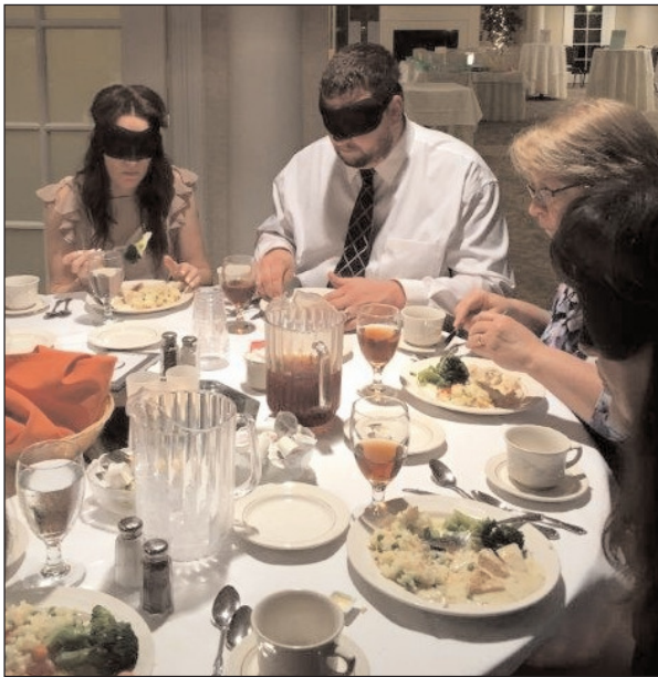
Guests had dinner wearing blindfolds.