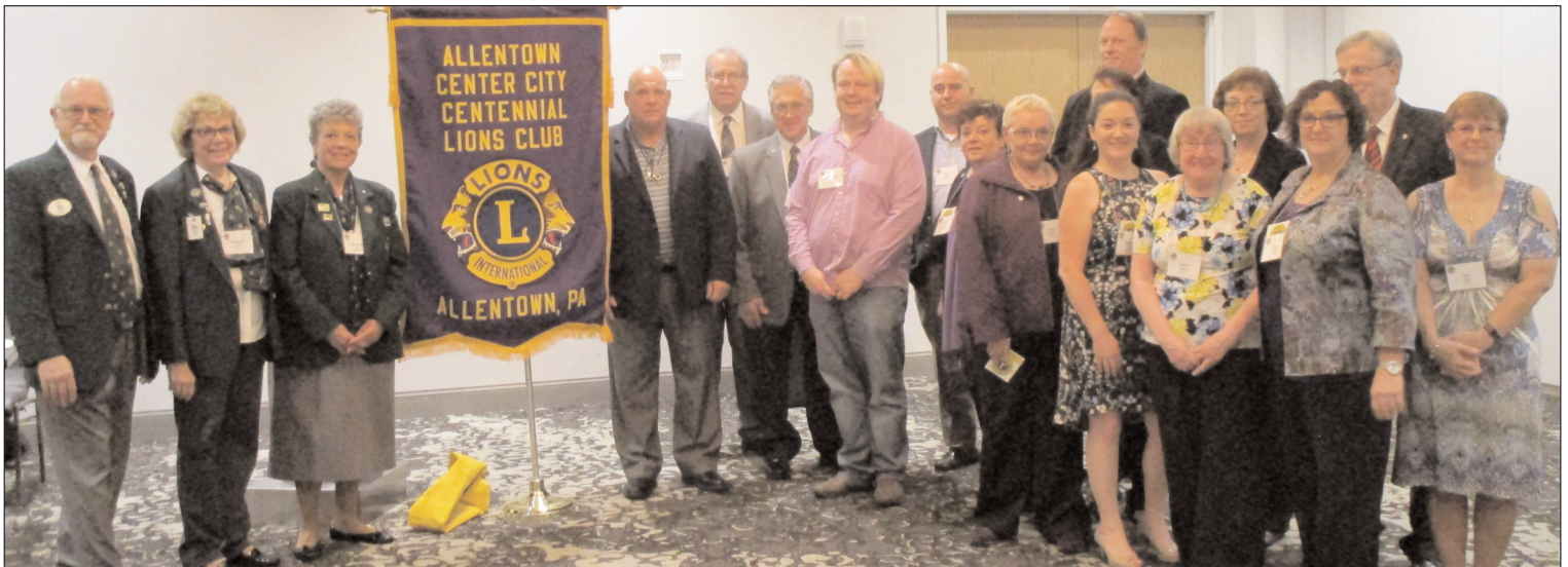
Congratulations to the new Charter Members and Officers the Allentown Center City Centennial Lions Club. Everyone was treated to a great meal, entertainment and fellowship. Thanks to members of the Upper Lehigh Lions Club for sponsoring this new club, and thanks to the clubs who attended and presented donations.