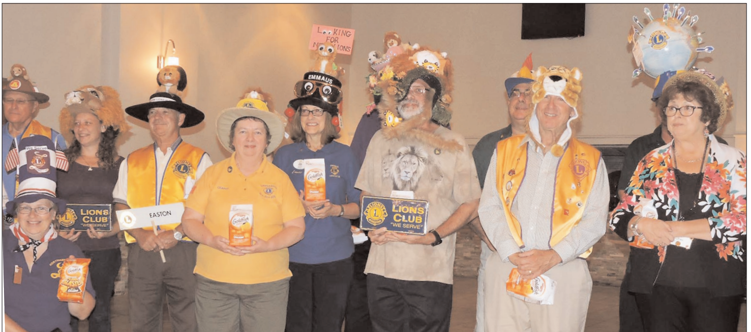
All the club presidents put together special hats for judging and adding a little hilarity at the annual District 14-K Rally on September 28 in Northampton.