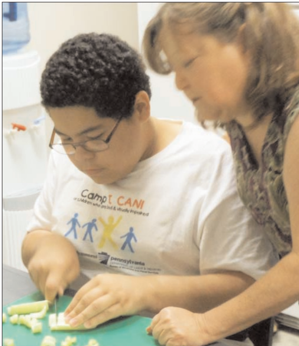
Camp I CAN! day seven teaches kitchen skills.