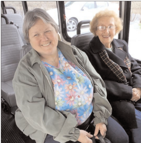
Customers on new Transit bus.

The location is the Northampton Memorial Community Center, 1601 Laubach Ave., Northampton. The event begins with a Gathering Hour from 5-6 p.m. Dinner will be served at 6 p.m., followed by the program.