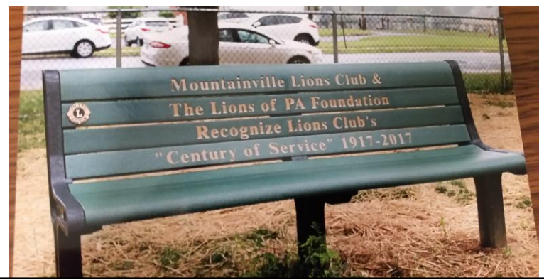
One of two bench donated to Roosevelt Elementary School by the Mountainville Lions Club

The completion of this project will impact the lives of the students, faculty, family members when they gather at the school's playground.